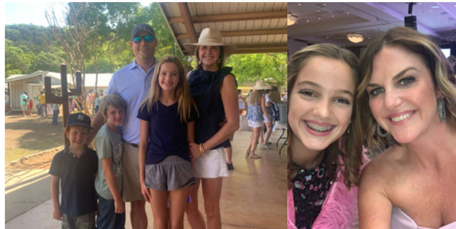
Camp LaJunta - Summer 2022