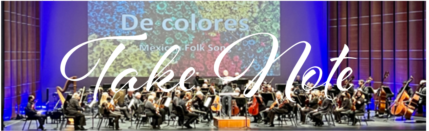
Young People's Concert, February 28, 2023