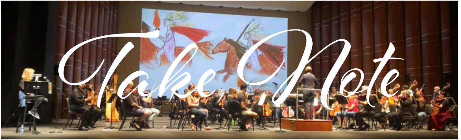
The Austin Symphony Orchestra performs at the Children's Halloween Concert, October 2021.