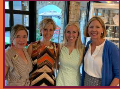
New Member Event at Adelante - September 9th, 2019